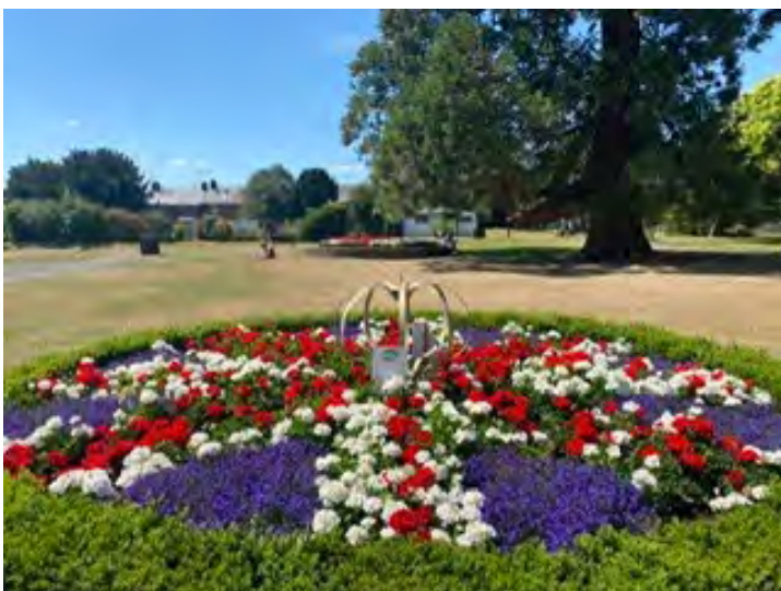
Thank you Headley Financial Services for sponsoring the Jubilee themed bed in the Public Gardens.

Alton in Bloom has been re-imagined for 2022. With the Council's stance on climate change and environmental issues, the traditional format of 'In Bloom' is being replaced with a new concept. Whilst there will be no award ceremony this year we are inviting residents to pledge to undertake one of the following categories below.