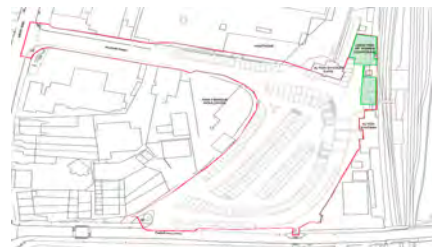
Figure 1. work site boundary;

We thank you in advance for your patience whilst these works are undertaken.