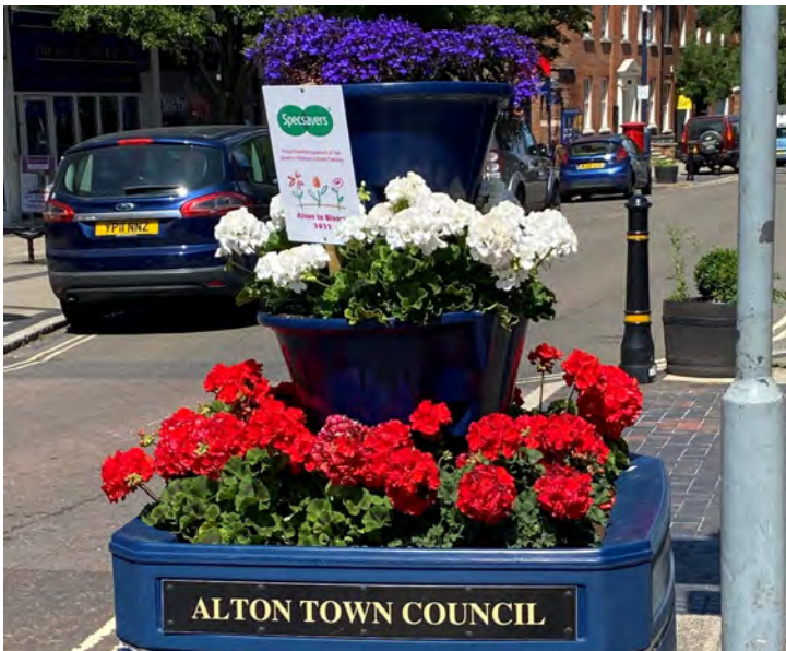
Thank you Specsavers Alton for sponsoring the Town Planters.

The Town Planters and the Public Gardens are looking extra special this year with the Jubilee themed planting which have been generously sponsored by Specsavers Alton https://www.specsavers.co.uk/stores/alton along the high street and Headley Financial Services https://www.headleyfs.com for the round Jubilee bed in the Public Gardens.